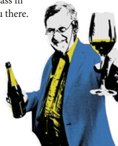
Hugh Johnson OBE, Sunday Times Wine Club President